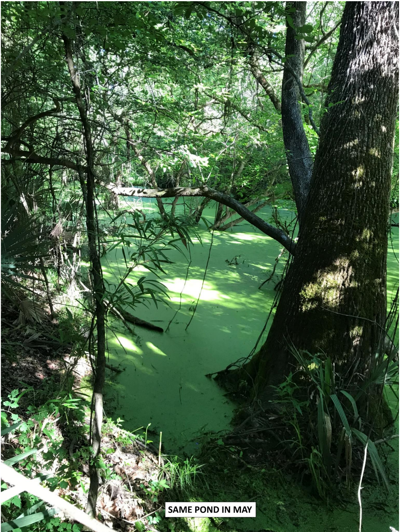
SAME POND IN MAY