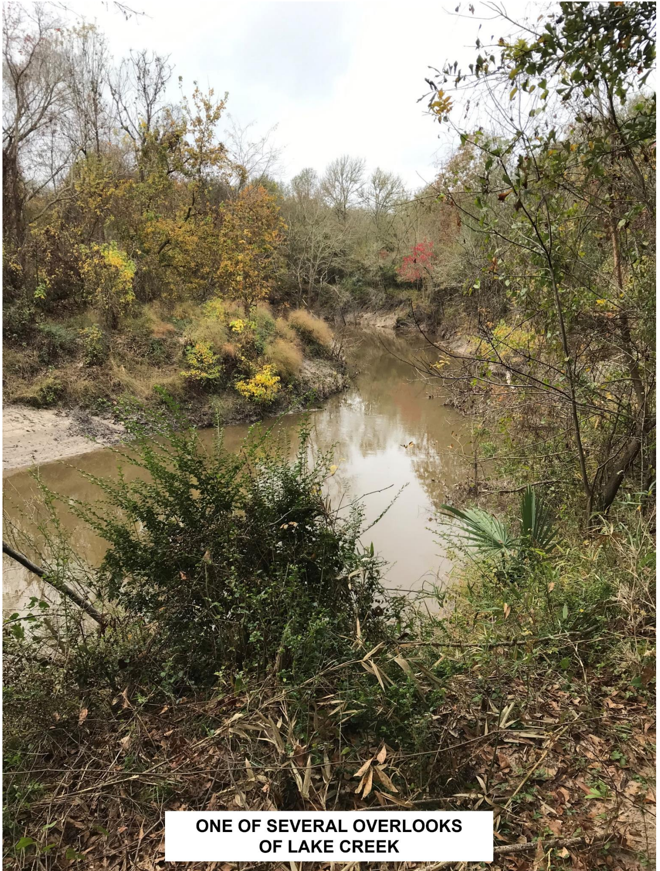
ONE OF SEVERAL OVERLOOKS OF LAKE CREEK