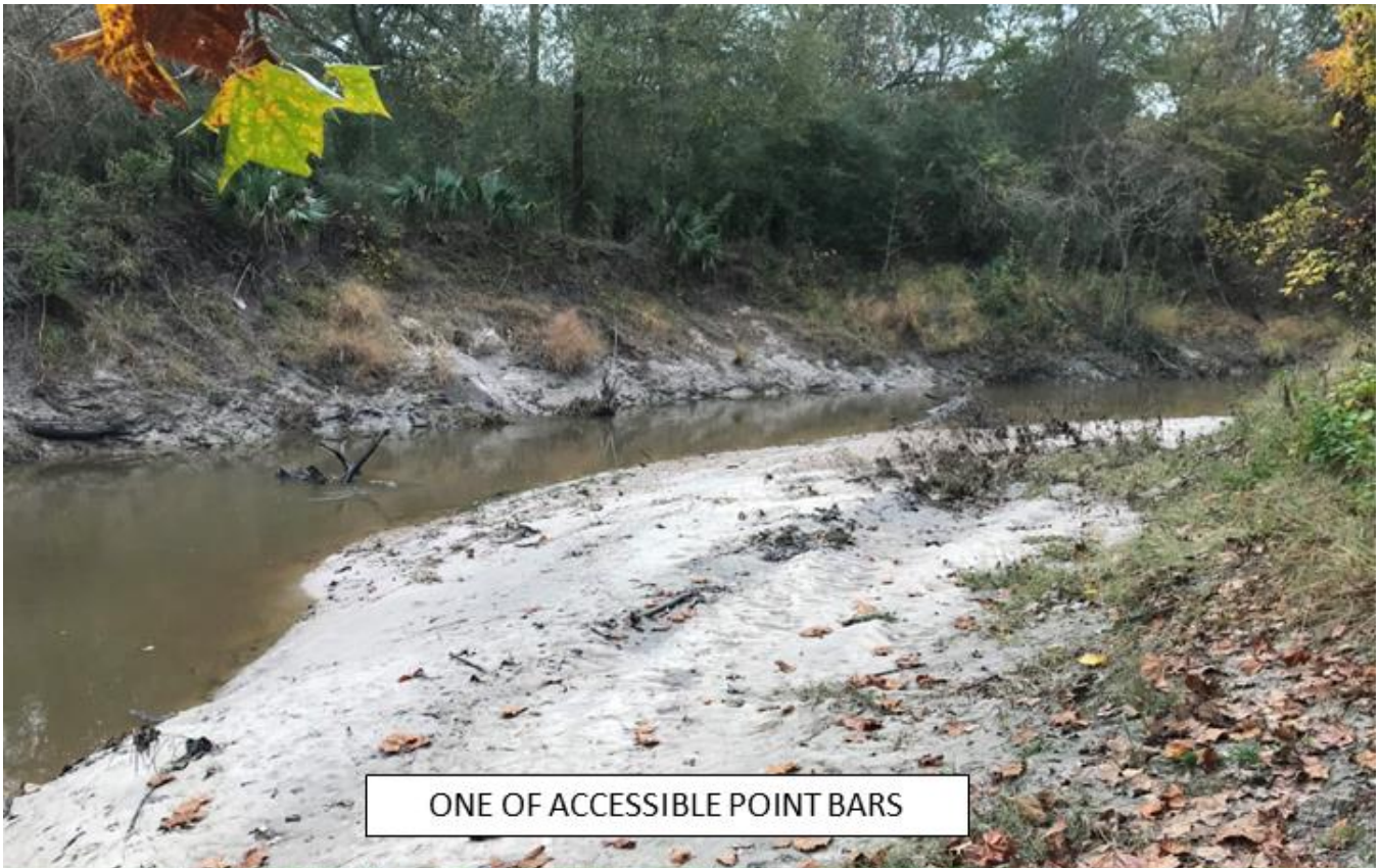
ONE OF ACCESSIBLE POINT BARS