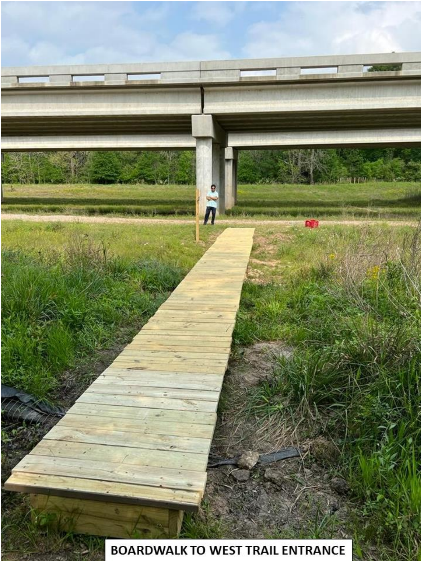
BOARDWALK TO WEST TRAIL ENTRANCE