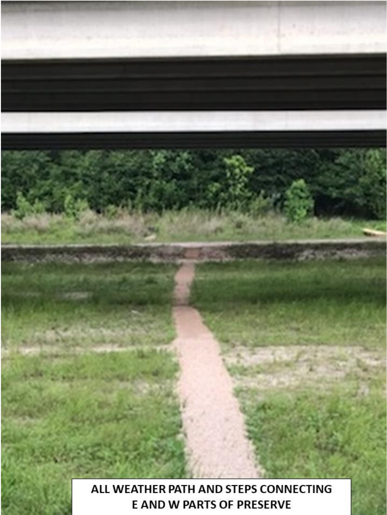
ALL WEATHER PATH AND STEPS CONNECTING E AND W PARTS OF PRESERVE