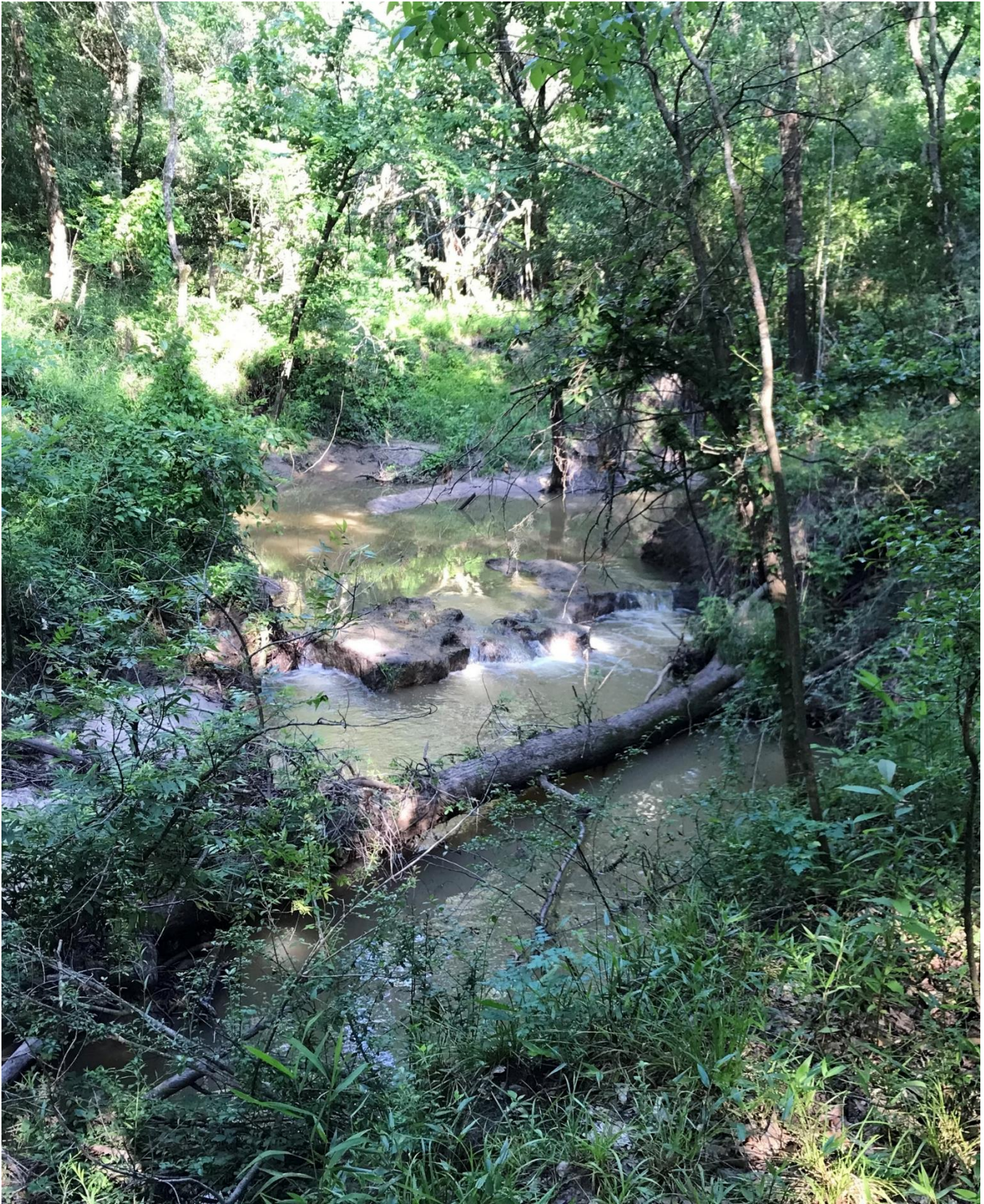
WATERFALL ON MOUND CREEK