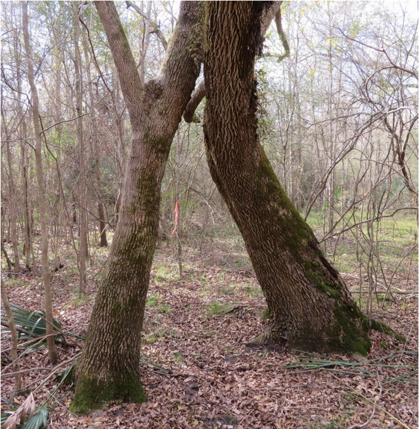
SWEETHEART TREES PATH GOES BETWEEN THEM